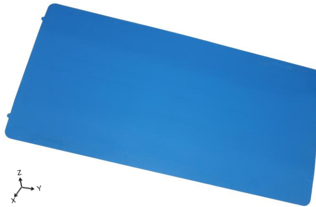
The A5530 Ground Mat