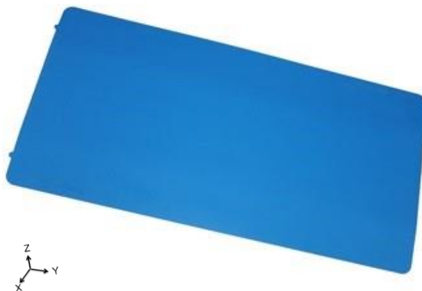
The A5530C Ground Mat