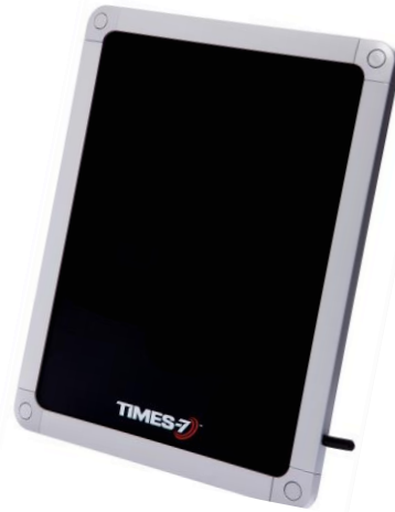
The SlimLine A6031