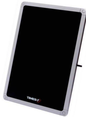
The SlimLine A6032