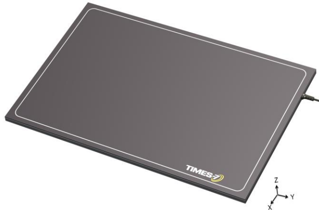
The SlimLine A7060

Ultra-low profile linear polarized flat panel antenna