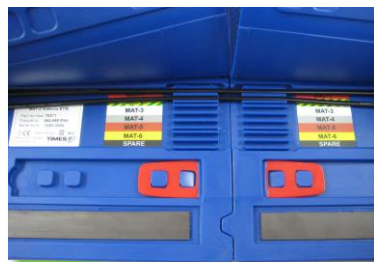
Integrated cable channels & Inter-connecting straps