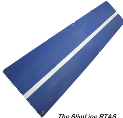
The SlimLine RTAS

Complete race timing antenna system – for deployments of up to 7 antennas