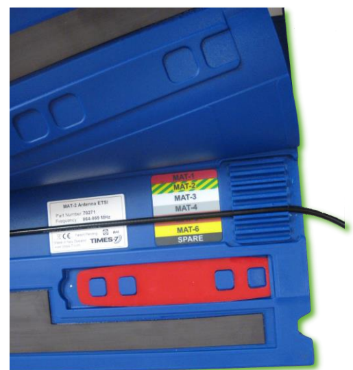
Integrated cable channels – Cable detail

Event and race-proven, the SlimLine RTAS has been extensively stress and performance-tested in hundreds of events around the world, putting this complete race timing antenna system in a class of its own.